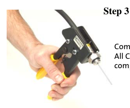
Compression (5/8MU shown). All CX RG11 connectors must be compressed in the same way.